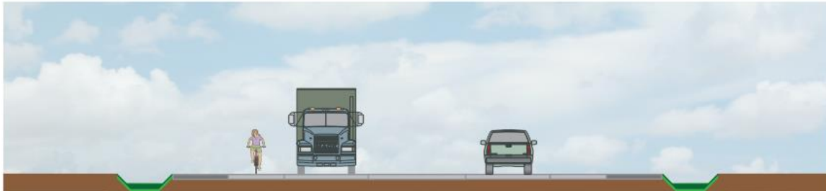
Figure 5 - 2a Typical Rural Arterial Cross Section