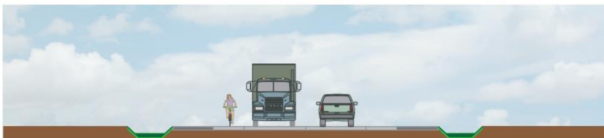
Figure 5 - 2c Typical Rural Collector Cross Section