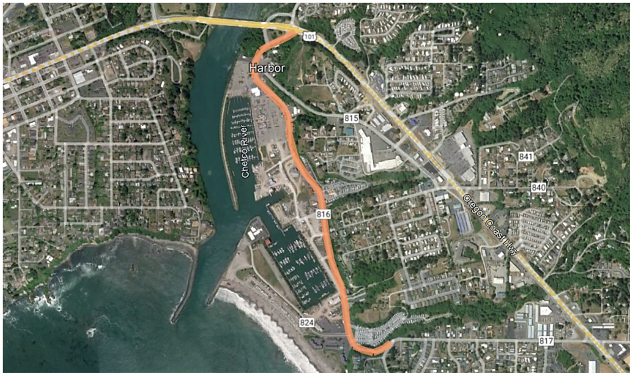
Figure 2: Lower Harbor Road Corridor