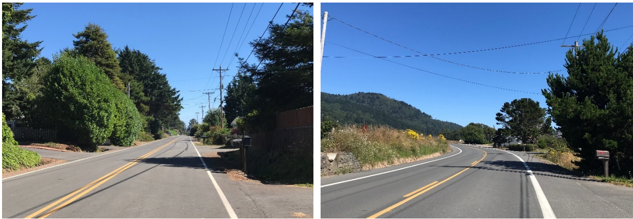
Figure 3: Oceanview Drive Corridor and Site Visit Photos