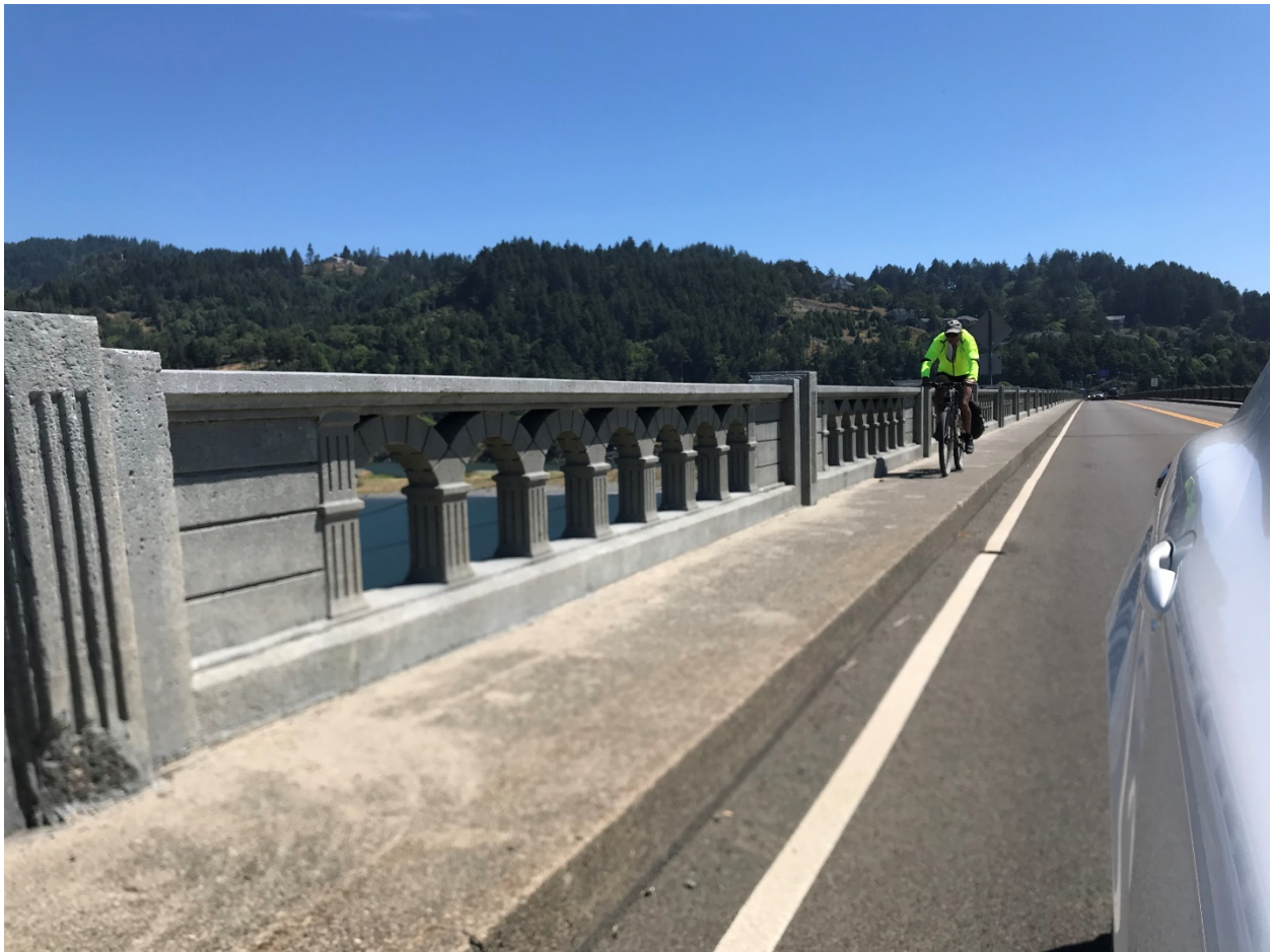
Figure 5: Bicyclist on Isaac Patterson Bridge over the Rogue River