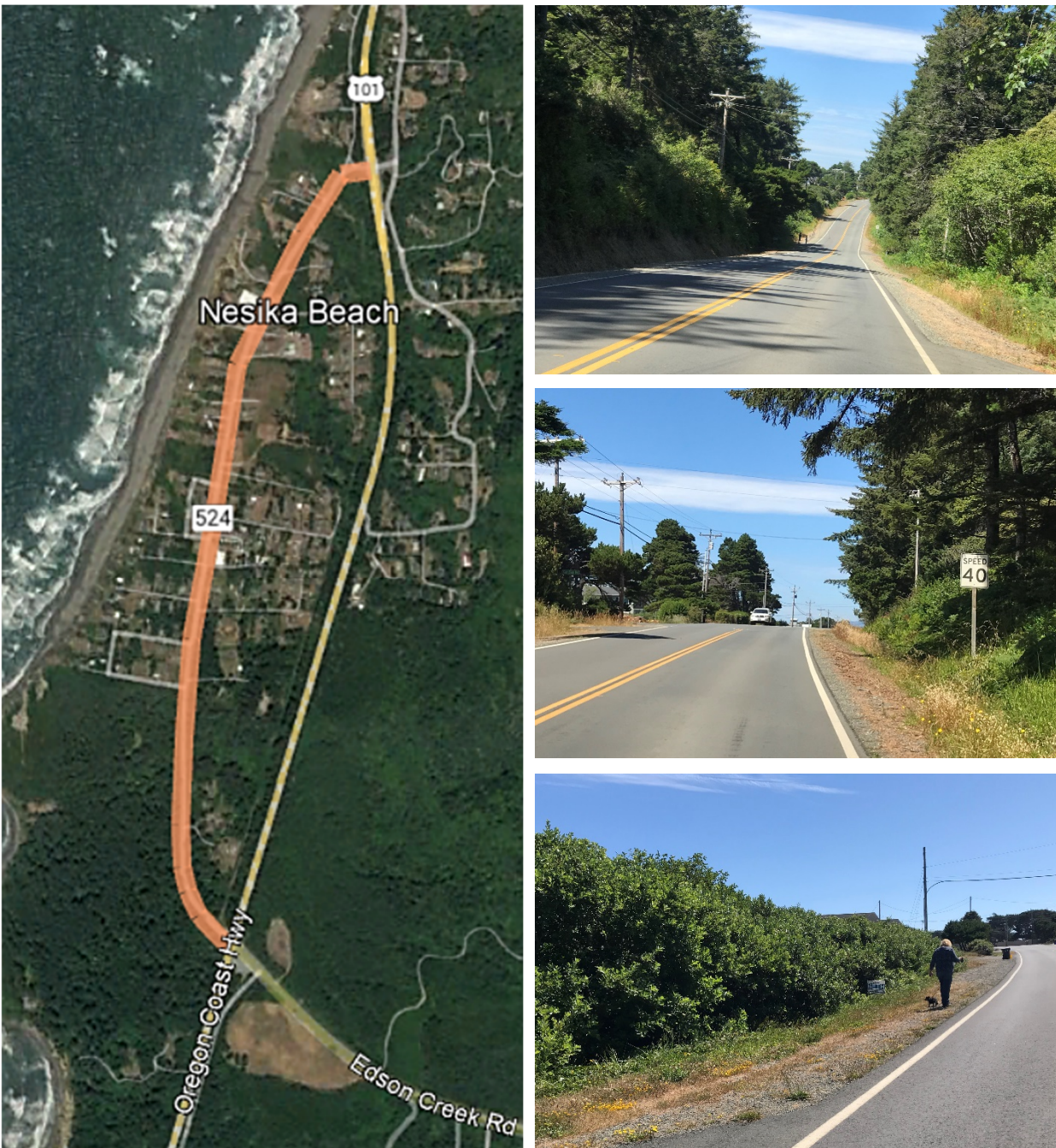
Figure 1: Nesika Road Corridor and Site Visit Photos